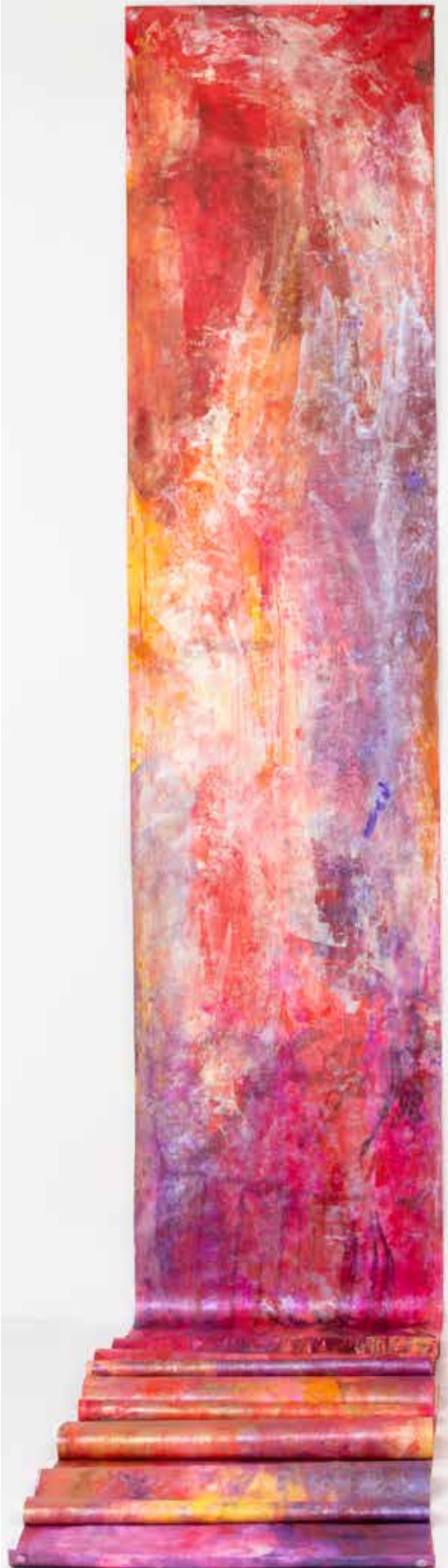
IMAGE RIGHT: ANNE LABOVITZ, INSPIRED BY DULUTH FOR DULUTH , ACRYLIC ON TYVEK®, DIPTYCH: LEFT 410.5", RIGHT 323" BY 66", 2018